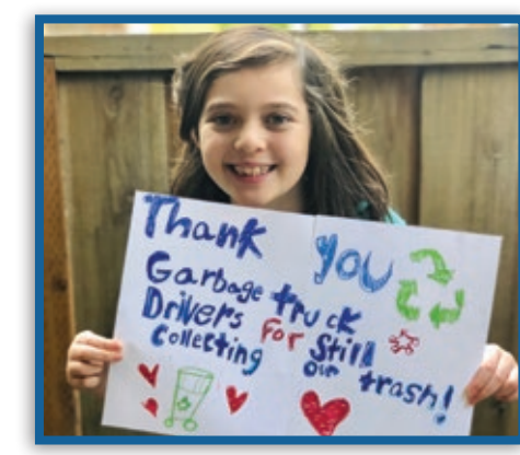
Penelope thanked her Walnut Creek driver with this poster!